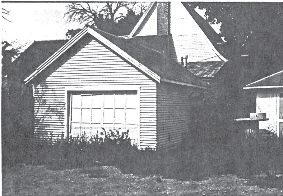
Roll# 33 Frame# 18

One-story addition at the SE rear of church. The addition has a gable roof with asphalt shingles. The addition also has a partial daylight basement with 1/1 double-hung sash windows. Gabled hood over entry is supported by brackets. There is a central interior chimney. Multi-lighted wood door entryway has a fanlight and cupola similar to that at main building. Clapboard siding.