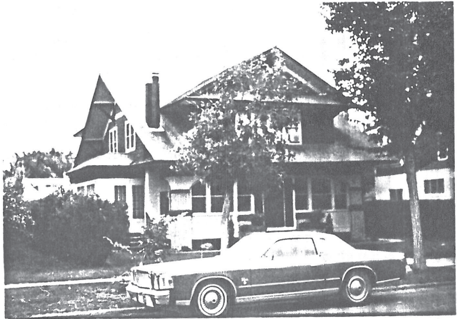
Roll# 34 Frame# 13

Legal Description: Decelles Second Addition, Block 6, lots 13 & 14 Address: 624 Fourth Avenue Ownership Name: Carteret Savings & Loan Address: %Sears Mortgage Compnay, P.O. Box 700, Lincolnshire, Ill. private: x public: