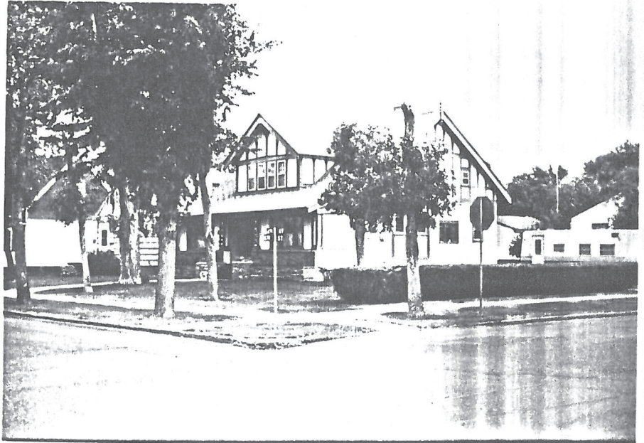
Roll# 34 Frame# 8

Legal Description: Decelles Third Addition, Block 6, lots 18-20 Address: 606 Fourth Avenue Ownership Name: Greg Durward Address: 606 Fourth Avenue, Havre, MT 59501 private: x public: