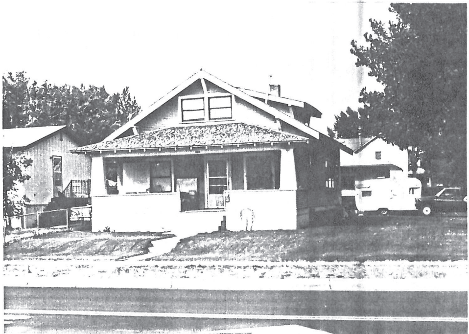
Roll# 36 Frame# 1