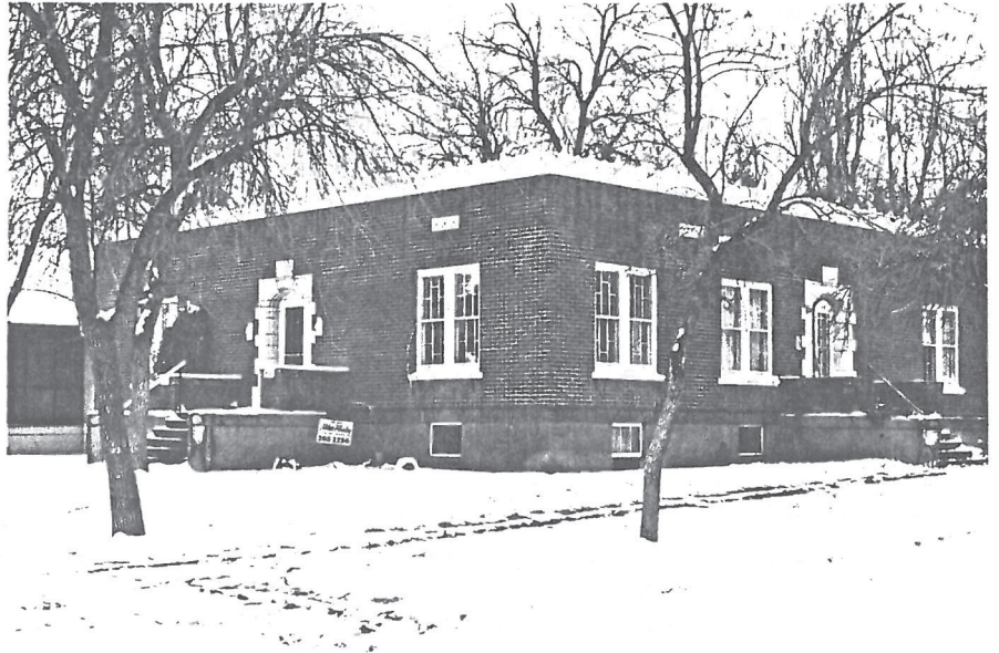
Roll# 3 Frame# 24-25

Legal Description: Decelles Fifth Addition, Block 1, Lots 19-20 Address: 602/604 Second Avenue/ 130 Sixth Street Ownership Name: James A. Longin Address: 602 Second Avenue private: x public: