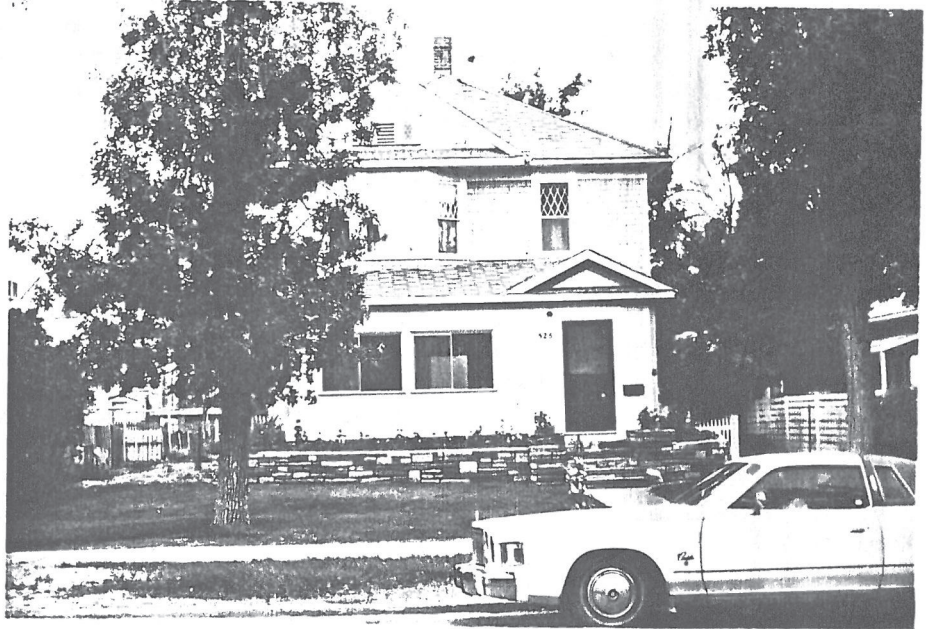
Roll# 34 Frame# 4

Legal Description: Decelles Second Addition, Block 3, lots 13 & 14 Address: 526 Fourth Avenue Ownership Name: Annabelle Salfer Address: 526 Fourth Avenue, Havre, MT 59501 private: x public: