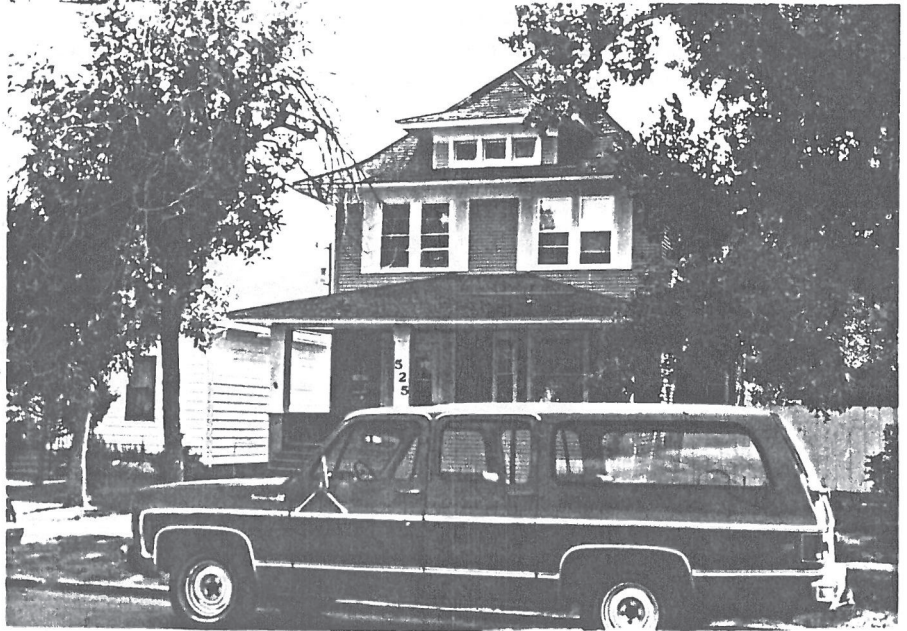
Roll# 33 Frame# 20

Legal Description: Morris-Smith-McCulloch Addition, Block 1, lots 8 & 9