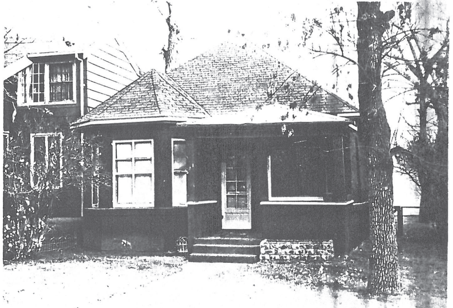
Roll# 4A Frame# 18A

Legal Description: Decelles Second Addition, Block 4, Part of Lot 5 and Part of Lot 6