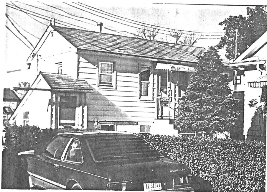
Roll #29 Frame #1A

1) A three-bay (originally two-bay garage) is situated behind (S) and to the west of the main house. The two easternmost bays are owned by the owner of 514 Fifth Street, while the other belongs to the owner of 504 Fifth Street. It was built before 1939 by two related to the same woman; one was her brother; the other her husband. The garage has undergone some renovation (i.e. the aluminum siding on its main (N) facade and the addition of an extra bay on the east). Originally it was stuccoed. This structure has lost its architectural integrity due to substantial renovations and would contribute to the proposed historic district.