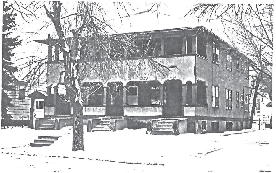
Roll# 3 Frame# 10

Legal Description: Decelles Addition, Block 1, All of Lot 1, Part of Lot 2.