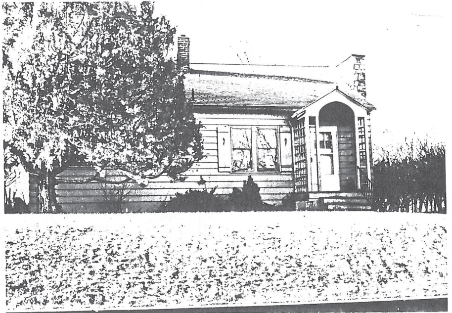
Roll# 1 Frame# 10

Legal Description: Meili-Almas Addition, Part of Block 8, and Gussenhoven Addition, Block 10, Part of Lot 3 and Part of Lot 4.