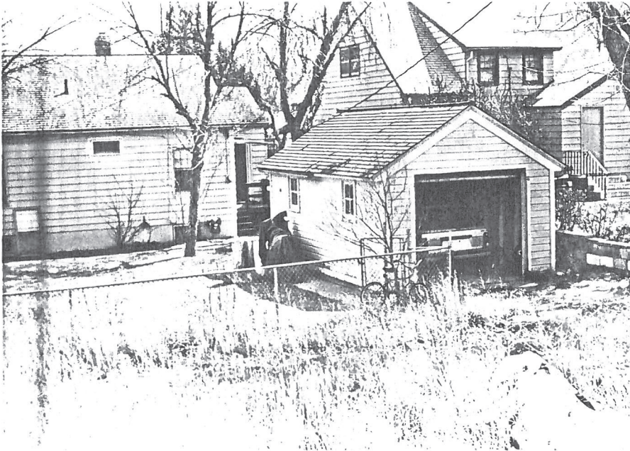
Roll # 22 Frame # 4

The site is raised well above that of the street.