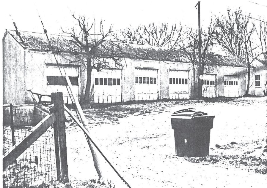
Roll # 22 Frame # 24-24A

Concrete retaining wall runs along the west edge of the property.