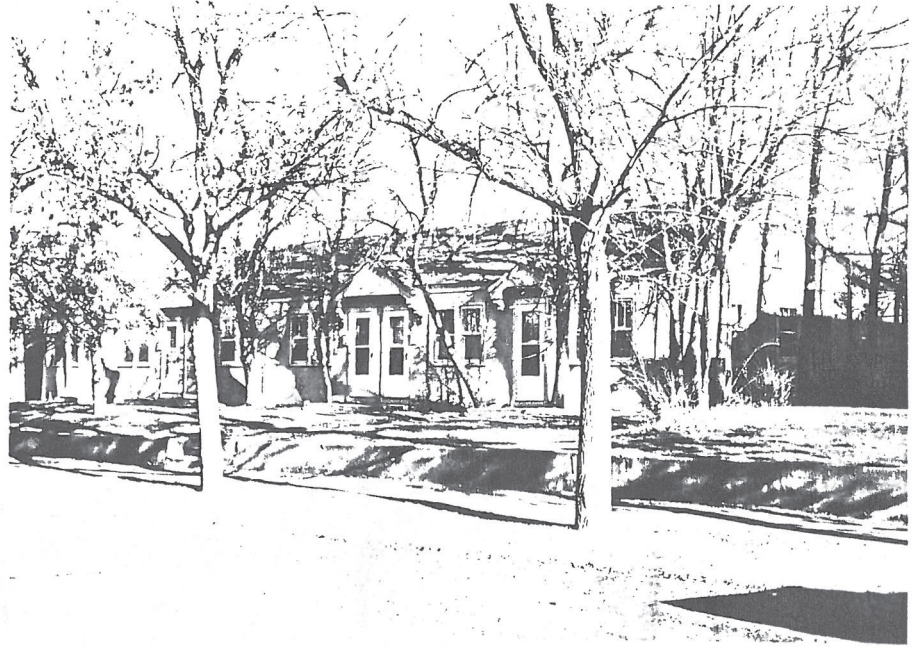
Roll# 1 Framed# 23-24

Legal Description: Meili-Almas Addition, Block 7, Part of Lot 6 and All of Lots 7 - 10.