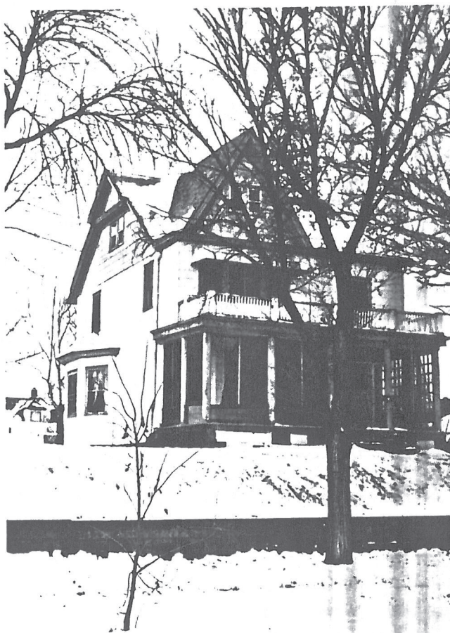
Roll# 3 Frame# 7

Legal Description: Havre Original Townsite, Block 19, Part of Lots 16 - 20.