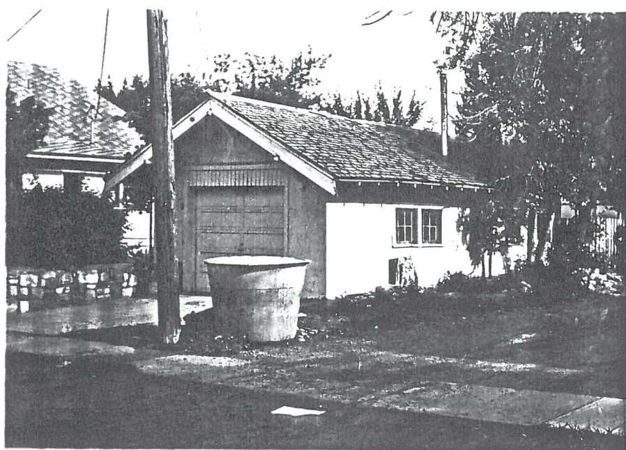
Roll #23 Frame # 19A

Full-daylit basement now has a separate entry on the north facade (236 Ninth Street) and houses a separate living unit. Site is raised gently from that of the street. The northern edge of the property is bordered with a colored stone and concrete wall.