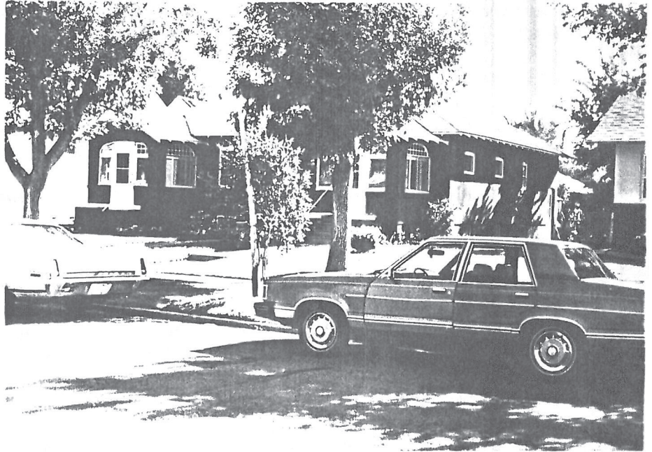
Roll# 32 Frame# 22

Legal Description: High School Addition, Block 3, lots 3 & 4 Address: 809-811 Fourth Avenue Ownership Name: Beatrice Burch Address: 811 Fourth Avenue, Havre, MT 59501 private: x public: