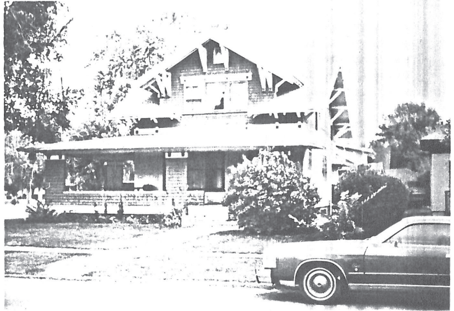
Roll# 34 Frame# 12