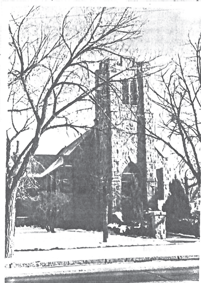
Roll# 38 Frame# 16

Legal Description: Decelles Third Addition, Block 3, lots 9 & 10 Address: 539 Third Avenue Ownership Name: St. Mark's Episcopal Church Address: 539 Third Avenue, Havre, MT. private: x public: