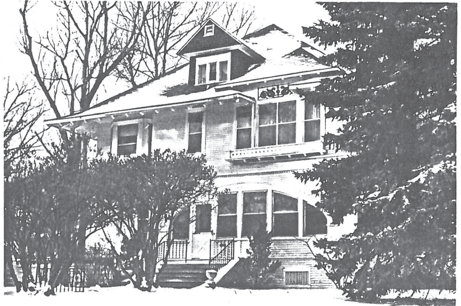
Roll# 3 Frame# 17-18

Legal Description: Broadwater Addition, Block 1, Lots 17 - 20