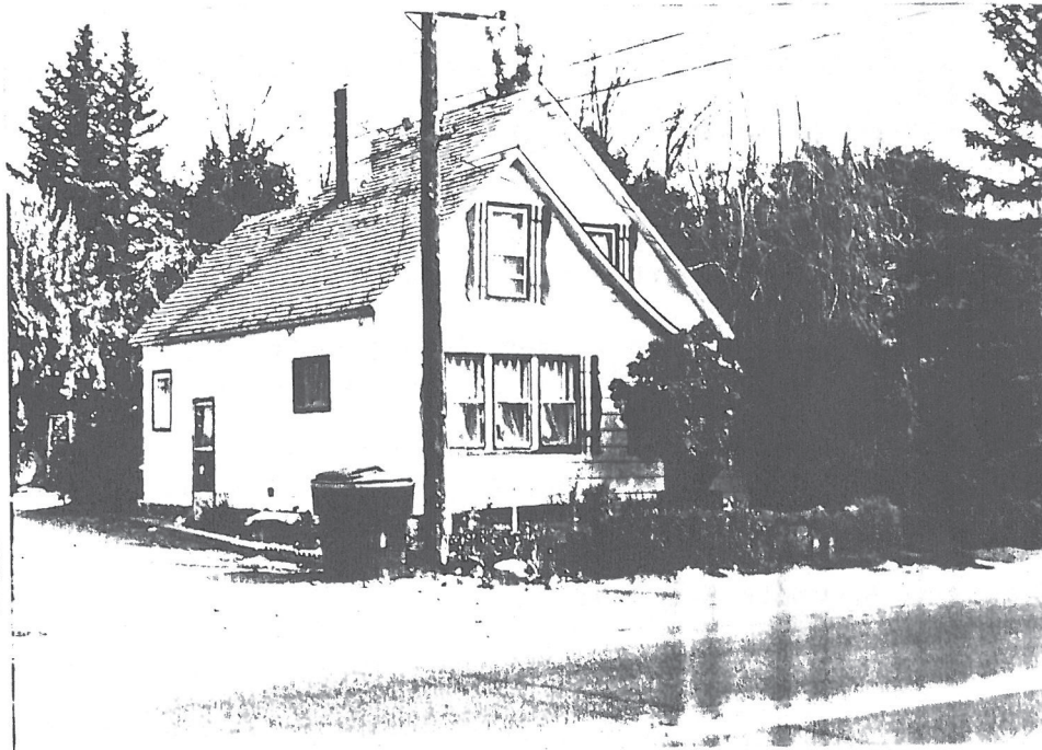
Roll# 37 Frame# 9

Legal Description: Lucke-Taylor Addition, Block 2, lots 9 & 10